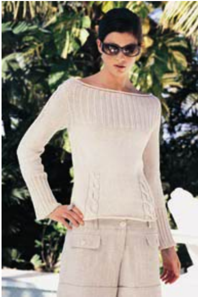
TAHKI YARNS COTTON CLASSIC PULLOVER Featured in the Spring/Summer 2007 Vogue Knitting