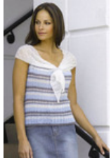
SUPERIOR Tank with Detachable Scarf

PLEASE NOTE: All online purchases are filled by authorized Tahki Stacy Charles retailers.