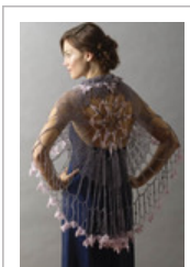
SUPERIOR Floral Circular Shawl