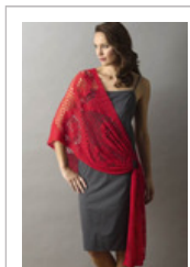
SUPERIOR Filet Crochet Sari Wrap