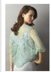
SUPERIOR Scalloped Capelet

A supersoft blend of cashmere and silk, perfect for lace and all fine knitting projects. The luxurious quality of this fine, brushed yarn is echoed in its sophisticated palette of solid colors.